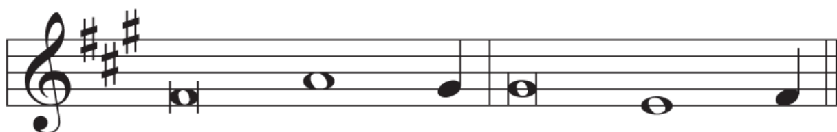
Psaumes 24+, 72, 80+, 89,2-6, 122+, 125+, 126